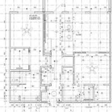
UNIT B1 - CEILING PLAN 16' x 17'