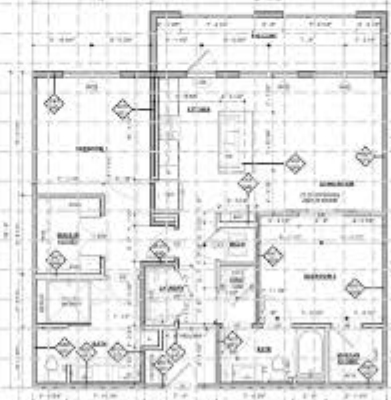
UNIT B1 - CONSTRUCTION PLAN 16' x 17'